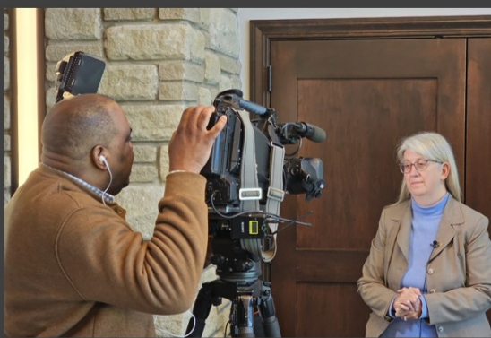
Tri-State Rotary Club hosts Teacher of the Year Celebration