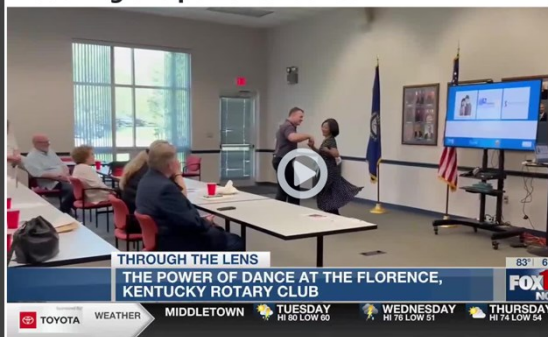
Preaching the power of dance