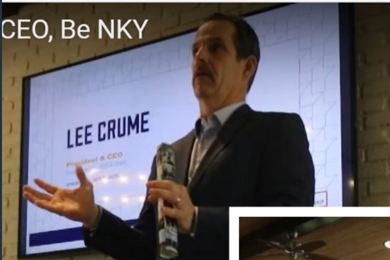
CEO, Be NKY