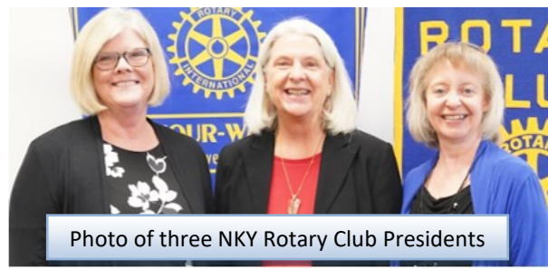
Photo of three NKY Rotary Club Presidents