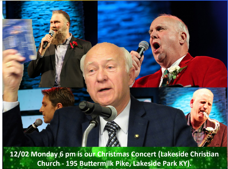
12/02 Monday 6 pm is our Christmas Concert (Lakeside Christian Church - 195 Buttermilk Pike, Lakeside Park KY).

“These stories need to be told and preserved for the future,” she said. “The preservation of these stories is critical to