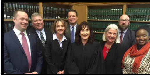
Feb 12 RCOFky-Day in Frankfort Tue 7 AM - Frankfort, Kentucky - Frankfort, Kentucky