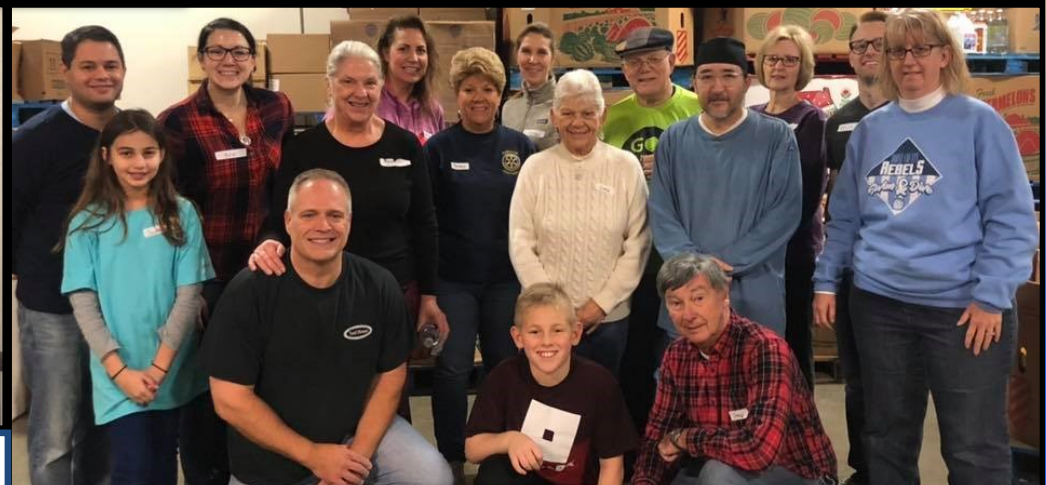
Our district grant at work. Rotarians at work throughout the process of supporting this wonderful organization. GO Pantry