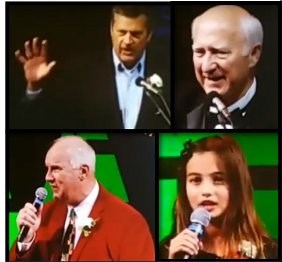
Our 59th Annual Rotary Christmas Concert

AAA/Bob Sumerel Tire & Service; Aaron Donald Law; All State Insurance; BB&T Bank; Best Way Disposal; Boone County Public Library; Earl Franks Sons & Daughters; Florence Freedom; Forcht Bank; Gateway Rehabilitation; Heritage Bank; Kenner Dentistry; LaRosa's; Long-branch Elementary; Master Provisions; Melissa Doss Law; Minutemen Press;