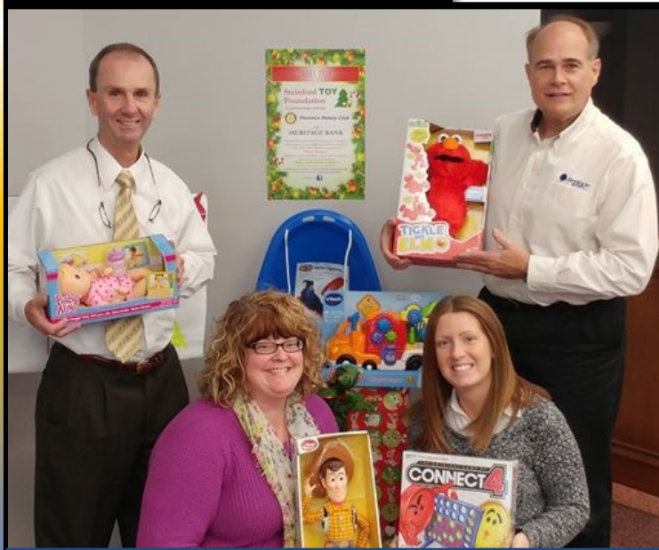
Thank you Heritage Bank ! 18 Locations ... wow!