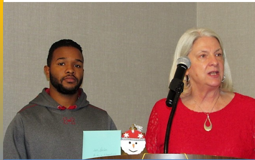
JJ from the D.R. & Barb

On busy days and at peak hours - weekdays around 5 p.m. and Fridays after 3 p.m. - Anderson keeps two boats in operation to limit waiting in line. The trip takes 10-15 minutes as the ferry boats motor along at 12 miles per hour ... which might top the speed of motorists crawling along I-75/I-71 north-bound at the same times.