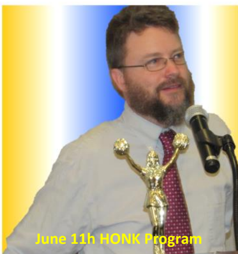
June 11h HONK Program