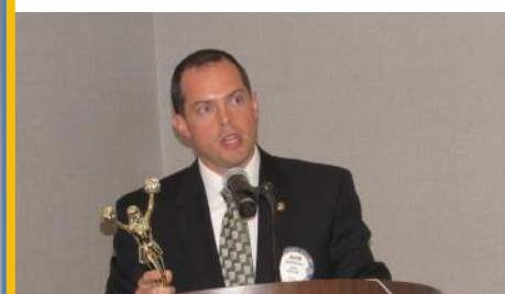
Congrats to Team 5 (Media) on winning a Social Media & Newsletter District Award