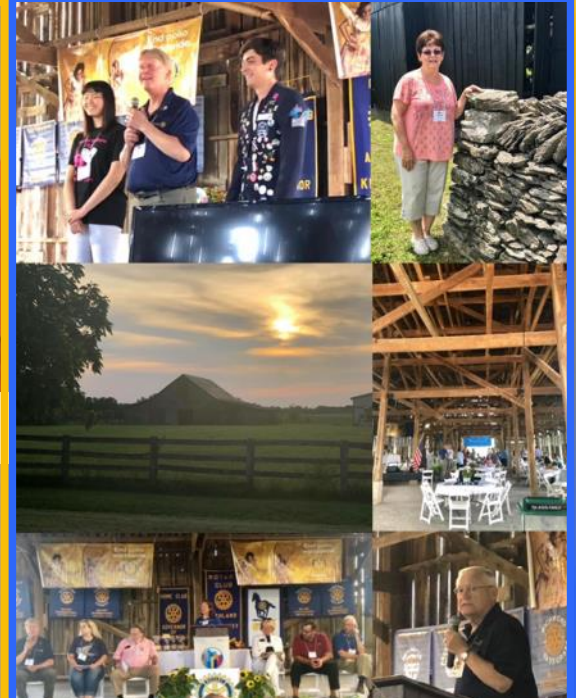
District Conference held in Shaker Village at Pleasant Hill