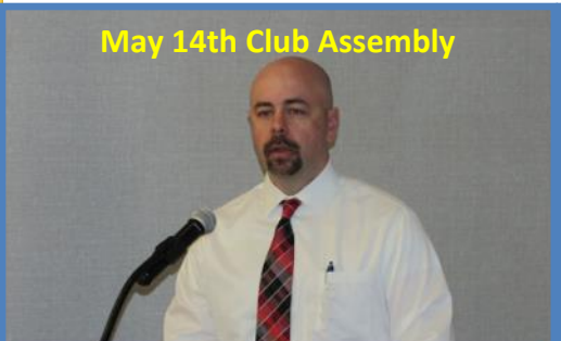
Boone County VOAD Program Discussion (Webster)